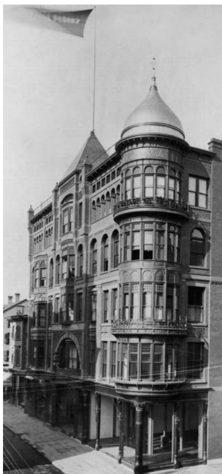
Photo of Conrad Building c. 1890