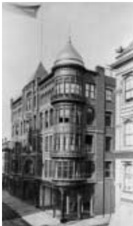
Photo of Conrad Building, c. 1880, courtesy of the Rhode Island Historical Society.